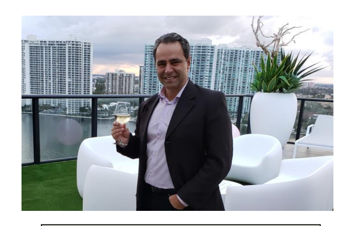
Real Estate Agent Elite International Realty (2018 - Today)